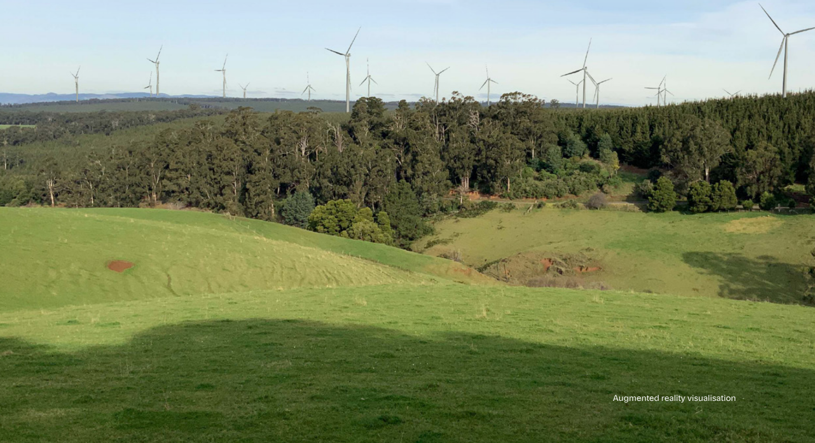
Augmented reality visualisation